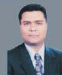
Risk Based Auditing of Information System Course Code (A - 03)